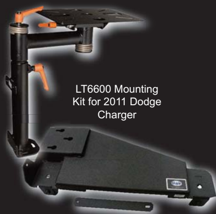
LT6600 Mounting Kit for 2011 Dodge Charger