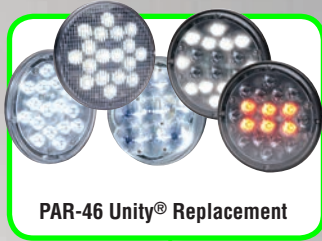
PAR-46 Unity® Replacement