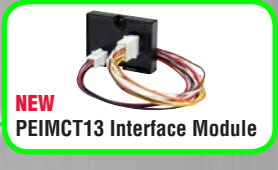
NEW PEIMCT13 Interface Module