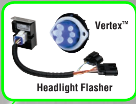
Vertex™ Headlight Flasher