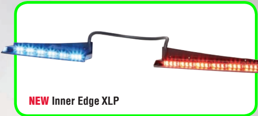
NEW Inner Edge XLP