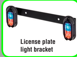
License plate light bracket