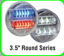
3.5" Round Series