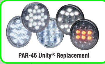
PAR-46 Unity® Replacement