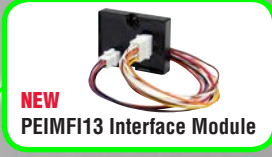
NEW PEIMF13 Interface Module