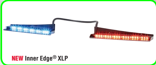
NEW Inner Edge® XLP