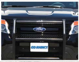
PART NO.5340 PUSH BUMPER