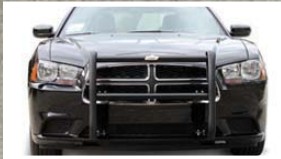
PART NO. 5076 PUSH BUMPER