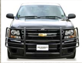
PART NO. 5162WHD DOUBLE REINFORCED BRUSH GUARDS