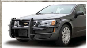
PART NO. 5082WHD HEAVY DUTY WRAPAROUND