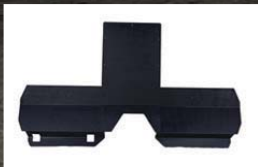
RECESSED & LOWER PANEL KIT 5700FTR