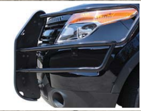
PART NO.5340WHD HEAVY DUTY WRAPAROUND