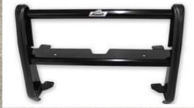
PART NO. 5076 PUSH BUMPER