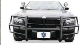
PART NO. 5076WHD HEAVY DUTY WRAPAROUND