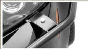
PART NO. 5076W SINGLE REINFORCED BRUSH GUARD