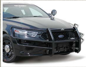
PART NO.5039WHD HEAVY DUTY WRAPAROUND