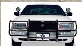
PART NO. 5038WHD HEAVY DUTY WRAPAROUND