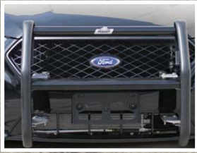
PART NO.5039 PUSH BUMPER