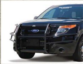
PART NO.5340WHD HEAVY DUTY WRAPAROUND