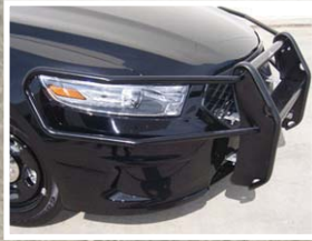
PART NO.5039W WRAPAROUND