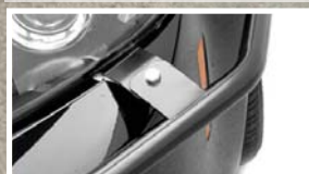
PART NO. 5082W SINGLE REINFORCED BRUSH GUARD