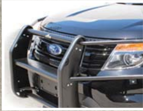
PART NO.5340W WRAPAROUND