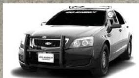
PART NO. 5082 PUSH BUMPER