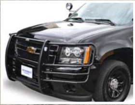
PART NO. 5160 PUSH BUMPER W/5162WHD BRUSH GUARDS