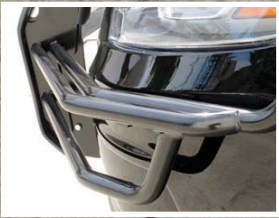
PART NO.5039WHD HEAVY DUTY WRAPAROUND