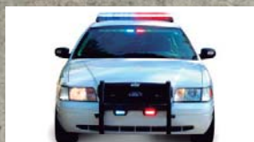
PART NO. 5038 PUSH BUMPER