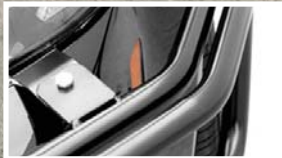
PART NO. 5076WHD DOUBLE REINFORCED BRUSH GUARDS