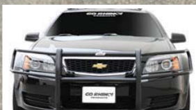
PART NO. 5082W WRAPAROUND