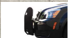
NO CUTTING OR DRILLING REQUIRED