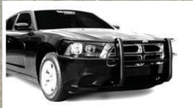
PART NO. 5076W WRAPAROUND