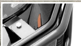
PART NO. 5082WHD DOUBLE REINFORCED BRUSH GUARDS