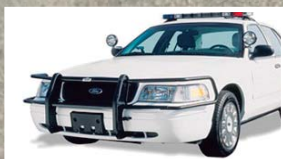
PART NO. 5038W WRAPAROUND