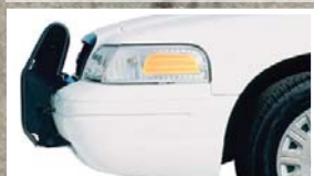
PART NO. 5038WHD HEAVY DUTY WRAPAROUND